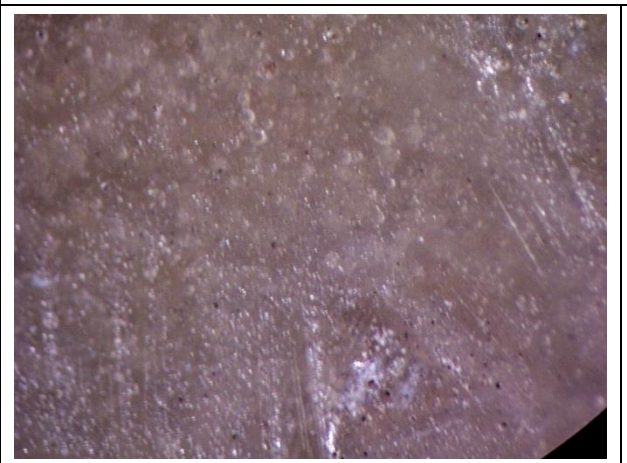
Figure 2. Surface of un-attacked polyester magnified 20x. Surface is relatively smooth, fibres embedded and air bubbles visible.