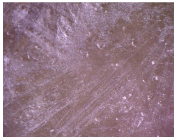
Figure 3. Surface of resin after three months exposure (20x mag.). The white decomposition materials can be seen and fibres exposed by removal of resin.