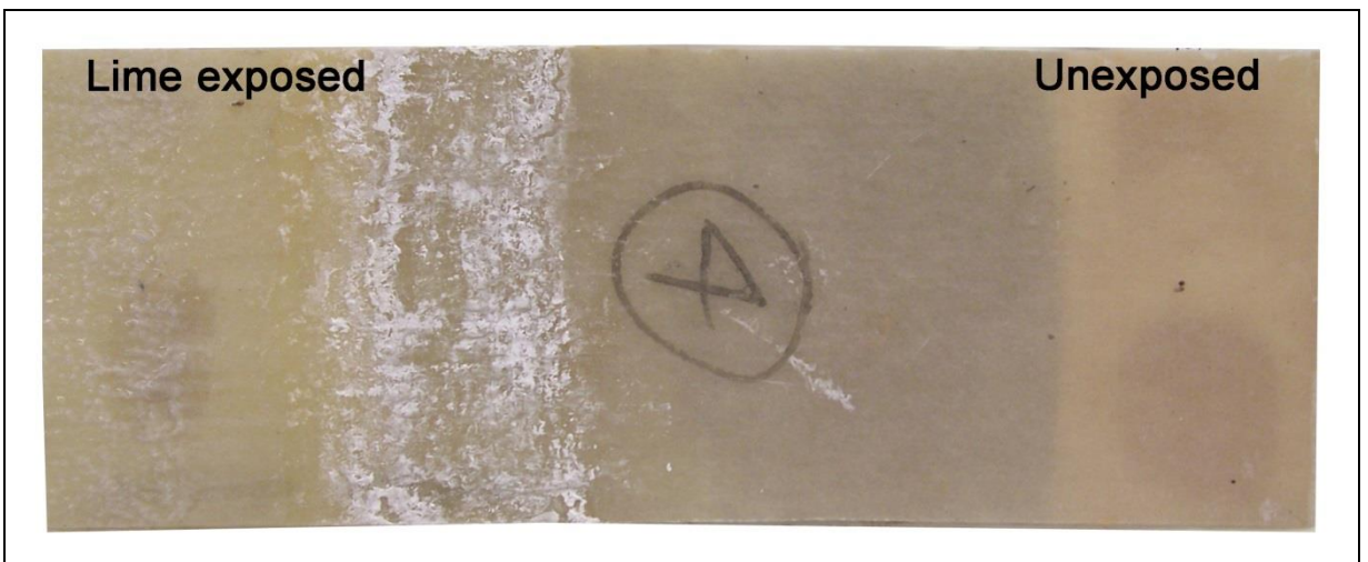
Figure 1. An example of a polyester resin shower base exposed to alkaline water for three months. A degree of corrosion is visible on the left of the sample and is visible as the white deposits.

In a tile system, the alkali attack from the free lime present in the cement based C class tile adhesives is the problem. The end result of exposure of the polyester surface to alkaline cement based tile adhesives in damp conditions is the gradual breakdown of the plastic surface (Figures 1-3). If this goes on long enough, the tile bond breaks down because the polyester itself has decomposed and the styrene is liberated at the same time. Any residual acid released with the styrene proceeds to attack the tile adhesive itself worsening the problem. The distinctive smell of styrene can normally be detected when the tile is removed and this is a clear indication of attack and breakdown.