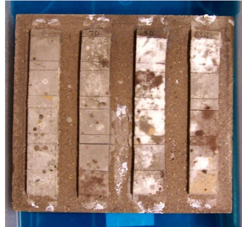
Figure 2. Samples of K80 dipped in a reactive silicate and left exposed externally for 2 months.