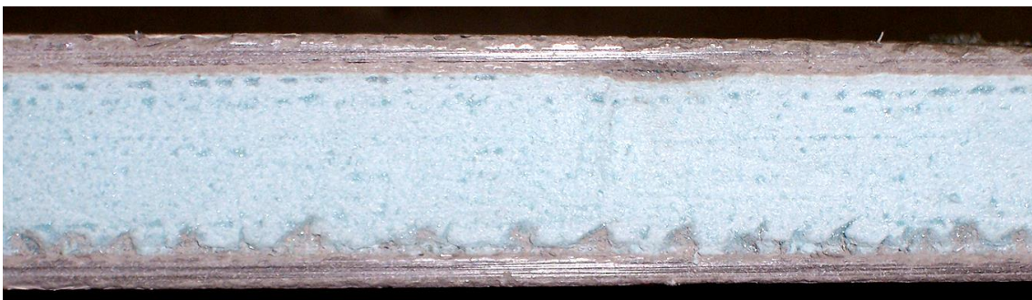
Polymer-cement-fibreglass reinforced faces with a foamed urethane foam core

Ardex examined two configurations of Universal Shower Base in 2013 and this bulletin covers the following two types.