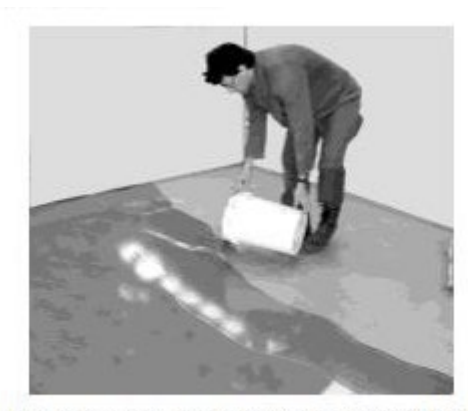
Pour the smoothing cement whilst walking along, and always apply to the wet working edge.

5. The thickness rake is used when leveling over tiles or surfaces that do not have significant relief (for example already flat or only lightly ground). Drag the rake at 90 degrees to the direction that the material was poured on the floor. Keep the head main bar vertical to obtain the correct thickness when dragging the rake. Overlap each pass by approximately 30%.