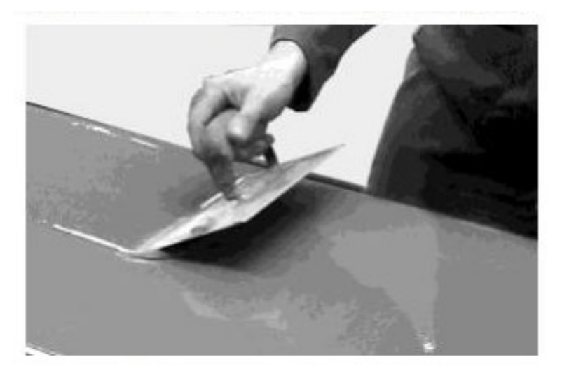
Hand trowelling of the FLC is necessary at doorways to finish off the job.

7. The last pass against a door or wall is done by pulling the tool along and walking backwards to the exit point, which is then finished with hand trowels. Note: Do not overwork the material as this causes fines to rise to the surface and results in a soft surface. Also do not work or walk onto material that has been previously laid for more than about 5 minutes.