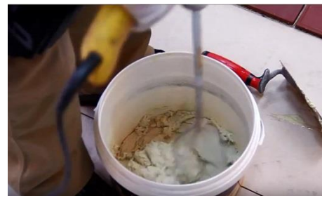
Mixing in the filler powder