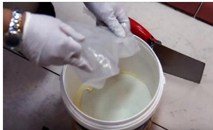
Mixing the combined Parts A+B resins and then adding the filler powder.

TIP: It is important that resin is mixed first before the powder is added. This makes sure the two resin components are correctly combined to react.