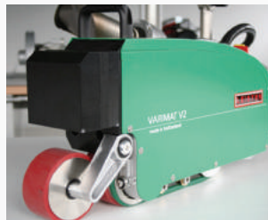
Membrane seams are welded on-site with an automatic Leister Variomat or Uniroof robotic welder.