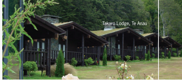
Takaro Lodge, Te Anau

Low slope roofs with ARDEX membranes provide the perfect substrate for a 100% waterproof living roof. Choose from a custom designed ARDEX Butynol®, ARDEX Root Repell™ or ARDEX TPO Living Roof system that can be welded on-site. Quick to install, single-ply and light-weight, ARDEX Living Roof Systems are a cost effective alternative to a bitumen system. They also give a substantial weight saving compared to a bitumen system (two layers of torch-on membrane), reducing the load requirements for a building significantly.