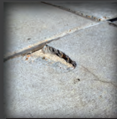
Fix traffic spalls in 20 min.