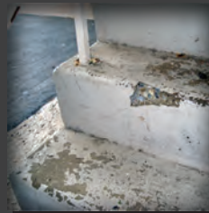
Repair broken steps