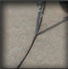
Fill control joints