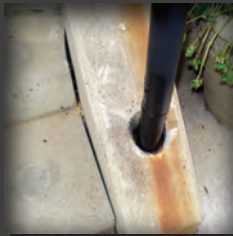
Secure loose railings