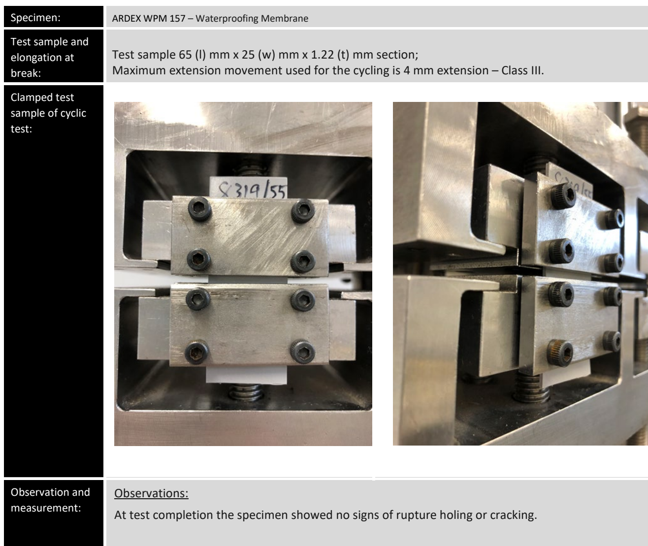
TABLE 5 TEST SAMPLE HOLING DURING CYCLIC MOVEMENT AND TEST RESULTS

The performance criteria set out in AS4654.1:2012, Table A3 and section B4, pass or fail criteria by observing any cracking, rupture or necking of more than 1 mm down from original width.