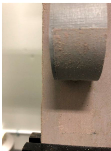
FIGURE 4 IMAGES OF TEST SAMPLE PERFORMING ADHESION-IN-PEEL