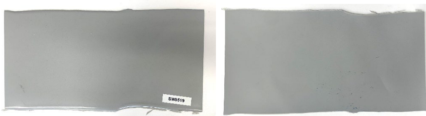
FIGURE 2 UNDERSIDE OF ARDEX WPM 157- WATERPROOFING MEMBRANE