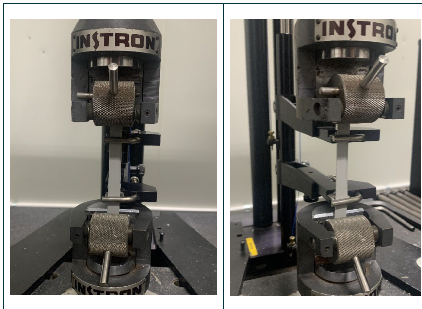
FIGURE 3 IMAGES OF TEST SAMPLE PERFORMING DURABILITY LOAD / ELONGATION TEST

The performance criteria set out in AS 4654.1:2012, Table A4 specifies a comparison of the immersed test samples to the unconditioned (control) test samples shall be greater than 25% elongation at break.