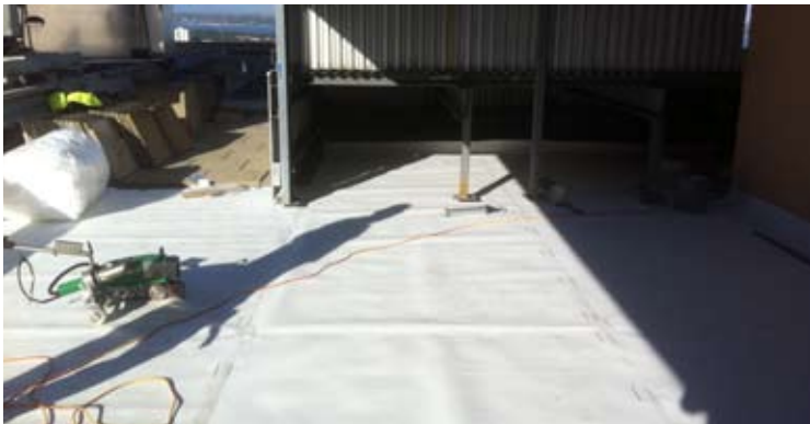
Pictured above: The old waterproofing membrane was covered with pavers.

On this particular project the old waterproofing membrane was covered with 600 x 600 concrete pavers which in most cases, would need to be removed and stored while the work was carried out.