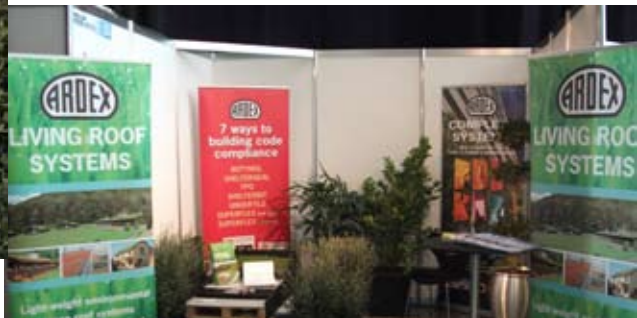
Pictured left and below Ardex New Zealand's 'Living Roof' display.

The New Zealand Institute of Architects 2012 Conference was held at the Viaduct Events Centre earlier this year. Ardex New Zealand's 'Living Roof' display created a great deal of interest amongst the 600 plus attendees who visited the exhibit during the three day event.