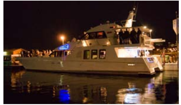
Pictured above: Moonlight Express River Cruise

A silent auction progressed during the evening for sporting memorabilia as everyone gambled the night away. The food served during the event was delicious and the martini fountain a huge success. The night finished with a dance off which resulted in nearly everyone on board dancing - many of whom continued to dance and gamble after the official event finished.