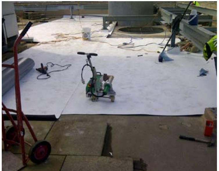
Pictured above: Leister Varimat V2 pictured on the roof of One Eleven St Georges Terrace, Perth.

TPO is one of the fastest growing low maintenance forms of roof waterproofing in the world and will prove an effective long term and low maintenance waterproofing system for One Eleven St Georges Terrace for many years to come.