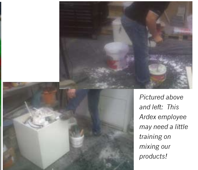
Pictured above and left: This Ardex employee may need a little training on mixing our products!