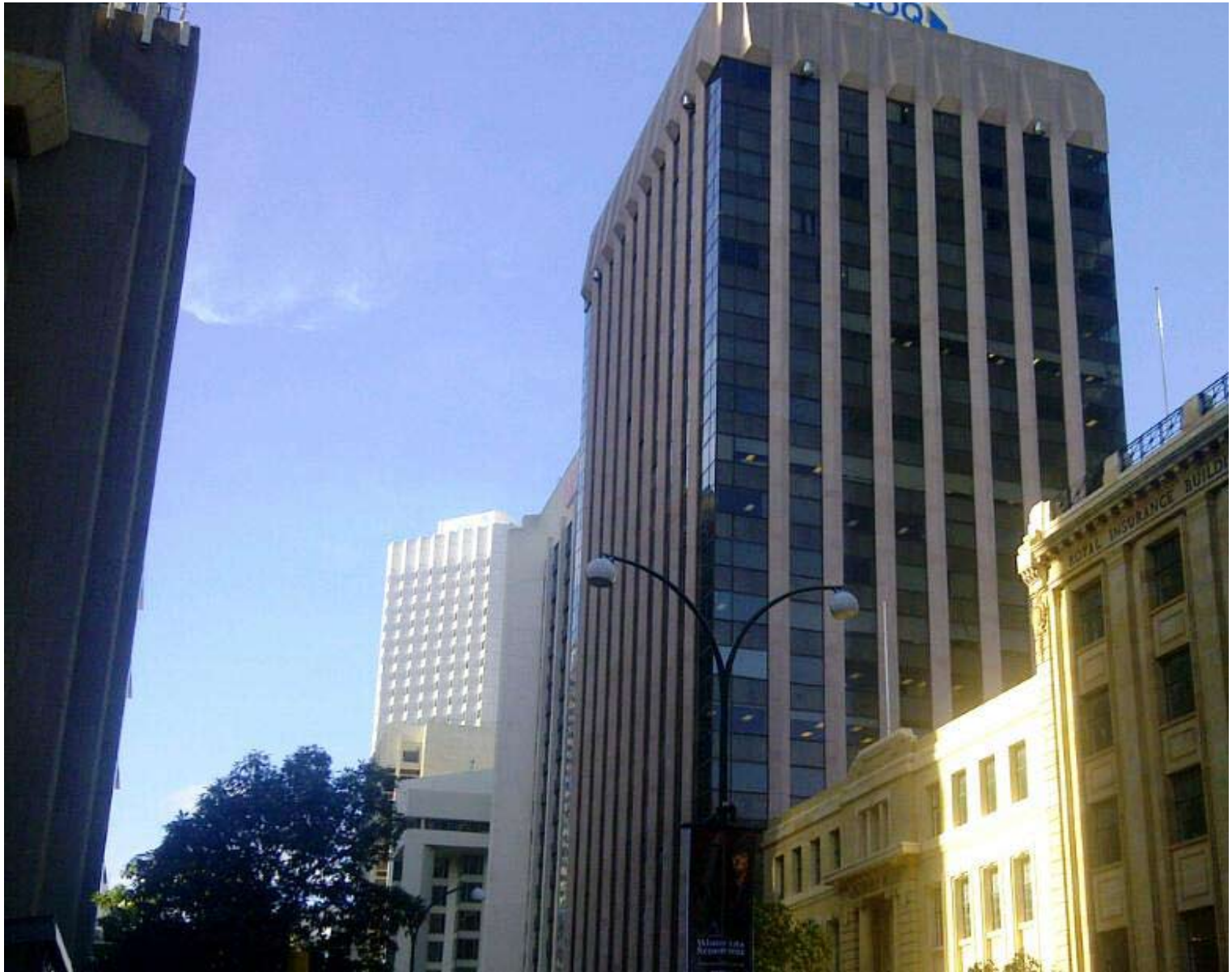
Pictured above: One Eleven St Georges Terrace, Perth, Western Australia.

Issue 8 Australia and New Zealand Edition