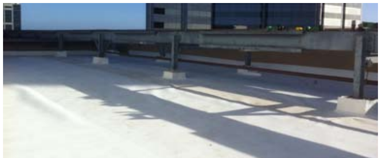
Pictured above: Completed roof with ARDEX TPO at One Eleven St Georges Terrace.