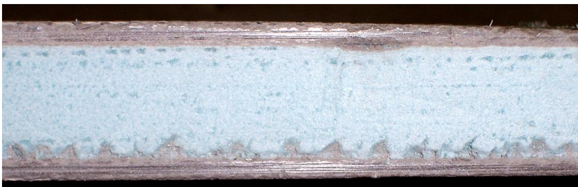
Polymer-cement-fibreglass reinforced faces with a foamed urethane foam core.

ARDEX examined two configurations of Universal Shower Base in 2013, and this bulletin covers the following two types.